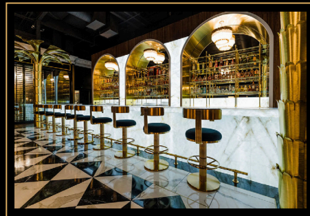
A FULL-SERVICE BAR