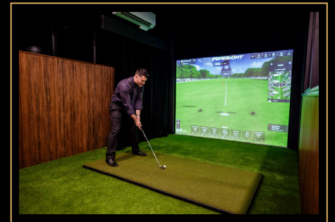
TWO GOLF SIMULATORS