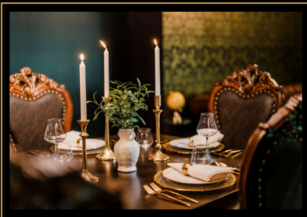
FOUR PRIVATE SUITES

Corporate memberships are available as well.